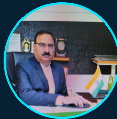
OP SINHA ED- HOI IRS ONGC